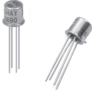
Product may not be to scale

The four pin TO-18 package is the smallest available in the miniature hermetically sealed series of networks. It should be the first choice for simple networks requiring multiple R's. This network can contain up to 5, V5X5 resistor chips. Note that case grounding limits the circuit options to a two resistor divider.