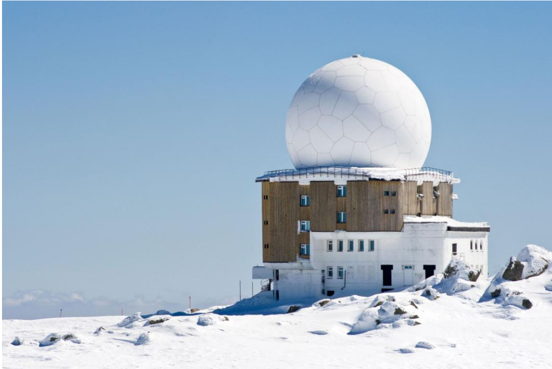
Figure 1 - Weather stations represent a prime example of a resistor application requiring the utmost in reliability and performance

such equipment must withstand the challenges of extreme environmental and operational stresses, and the resistors in particular must operate uniformly and reliably.